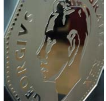
Ultra fine quality etching

Highlights - This Nickel Award features an oversize reproduction of a Canadian five cent piece. The material used is Supreme No.8 mirror finished stainless steel grade T304 of a 22 gauge thickness. The image from the coin was scaled up and etched onto the sheet metal then cut and sent to the Ontario Sheet Metal Workers Training Centre where it then was sent to Sudbury Ontario to be used in a training process whereby the full award was fabricated by trainees as part of the larger project initiative.