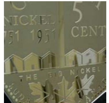
Detail view of high quality etching