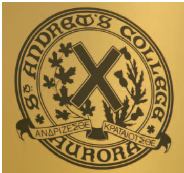
Close-up of etched and patina filled graphic

Highlights - This unique and functional donor wall is made of (25) 1/4" thick solid brushed bronze plates. Each of which are etched with custom graphics, patina filled and lacquer coated in matte finish. The pieces are offset precision mounted to give a floating effect.