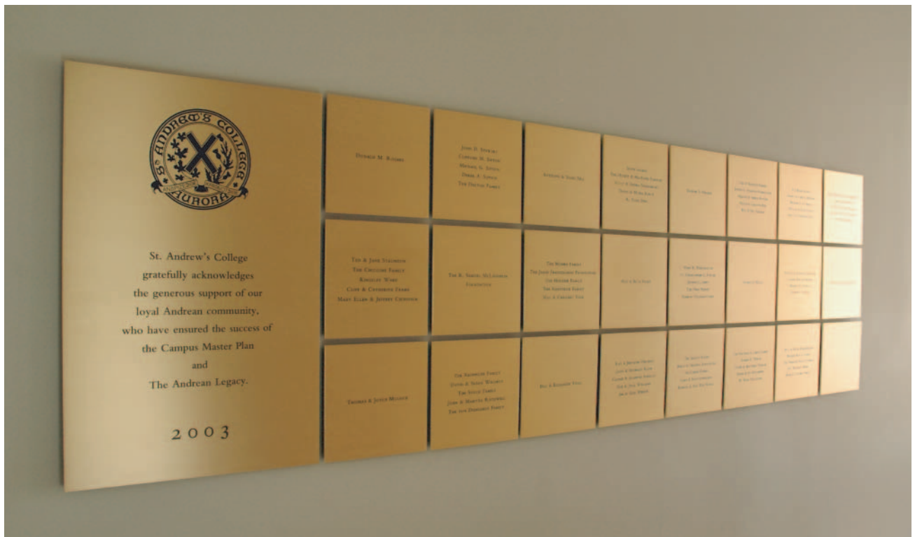
Donor wall made of (25) solid brushed bronze plates