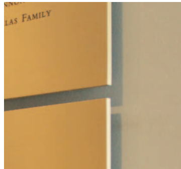
Offset, precision mounted plates give floating effect