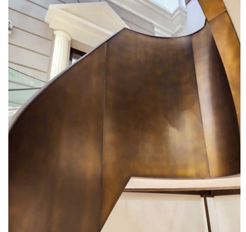
Detail of interior curved bronze cladding

Highlights - Structural steel staircase clad with SML-C3 patinaed muntz bronze inside and outside of stringers. 168' of railings are patinaed bronze and secured with custom built fasteners secured to posts and glazing. Structural steel components were 3D modeled and templated in shop and shipped to Bermuda for installation. Cladding is .050" Muntz Bronze cut and formed to the staircase. Stone treads and risers are comprised of white marble.