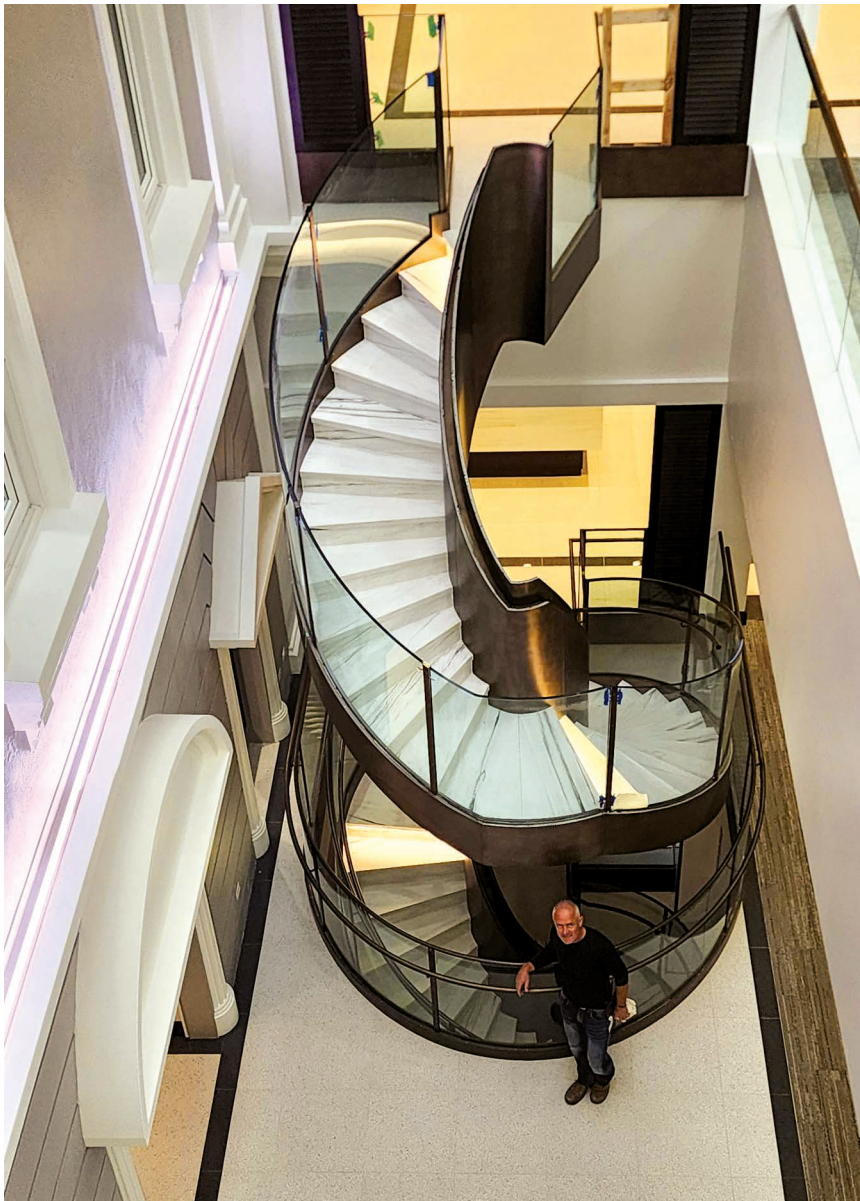
The three (3) story elliptical bronze clad staircase with patinaed railings and custom glazing.