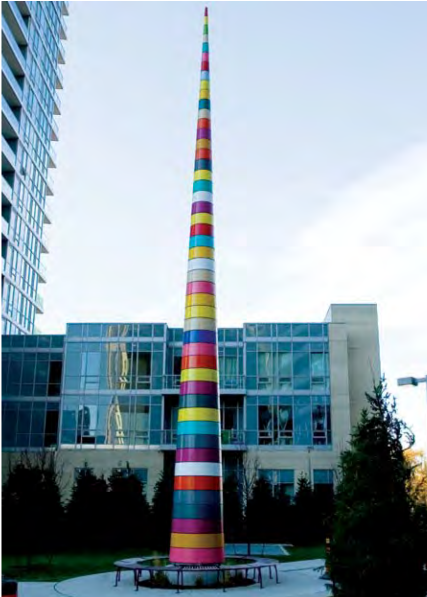
One of the 48'-0" cones with a wrap-around Riverbench™ located in the central exterior common area.