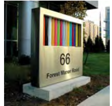
Custom building identification sign

Highlights - Main entrance art installation is a 60'-0", 60" in diameter at the base tapering to a 3" diameter at the top with three (3) more cones that are 48'-0" high, 48" in diameter at the base tapering to 3" diameter at the top through the central plaza area of the development. As well, there are six (6) cylinders, three (3) of which are 36'-0" high, 24" in diameter. Another cylinder at 48'-0" high, 36" in diameter is located at the community center within the development. All building entrance signs include the colourful design elements of the cons and cylinders. Soheil Mosun Limited Riverbenches™ are placed throughout common areas on the grounds. All cones and cylinders are fabricated from 1/4" thick "boat hard" fiberglass painted in 24 different colours using exterior grade UV resistant paint finish along with an interior galvanized steel structure.