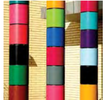
Detail of three (3) of the 24' cylinders