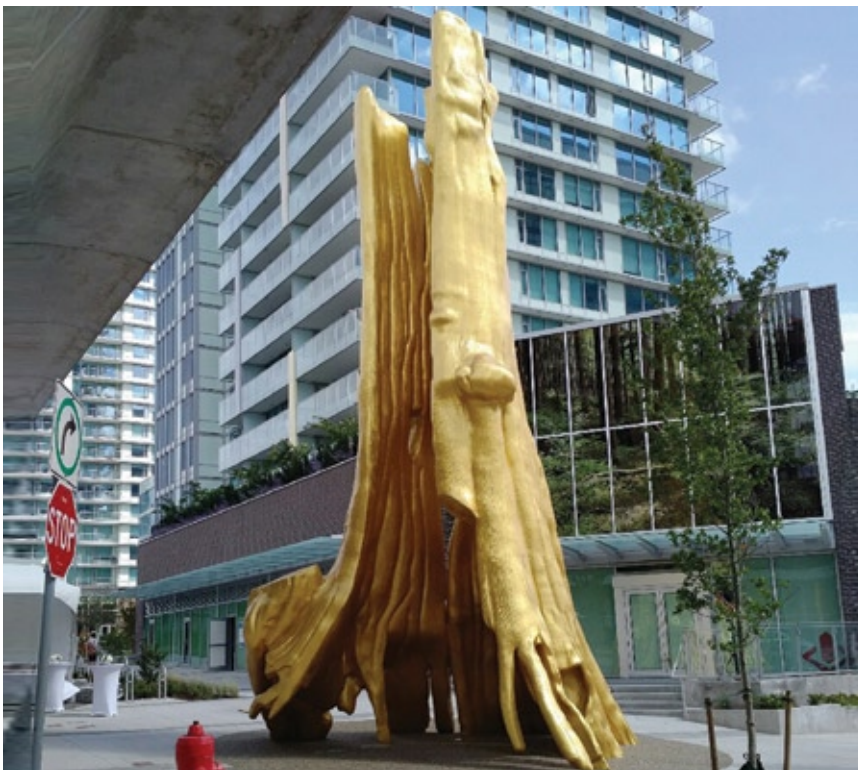
42' high The Golden Tree is at the corner of Cambie and Marine Dr in Vancouver.