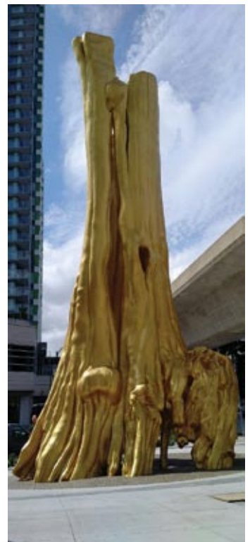
The reverse side of the Golden Tree.