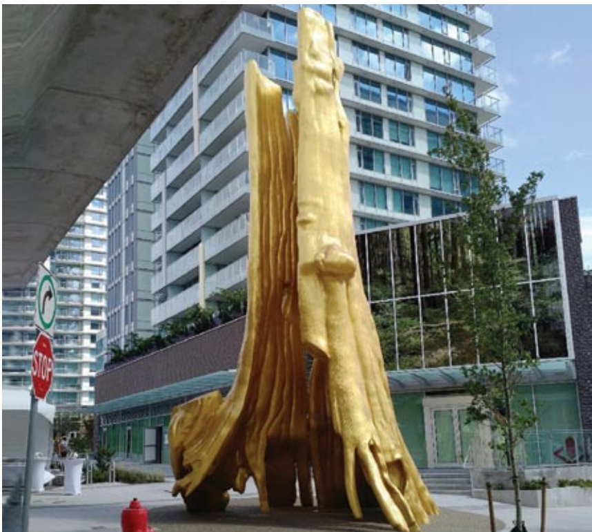
42' high, The Golden Tree is at the corner of Cambie and Marine Dr in Vancouver.