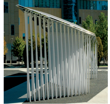
The pavilion viewed from the side

Highlights - This pavilion has a non-rectangular parallelogram shaped roof resting on four channeled braces. Its roof is a robotically welded and galvanized steel framework which is then clad with mirror polished stainless steel. The roof is supported with steel tubing that is powder coated with a titanium white gloss finish which sit within embedded channels in the concrete. There are 182 of these steel tubes in total. The footprint of the structure is 60' long on the north side, 45' long on the south, 15.5' on the east and 12.5' on the west. It stands at 14.5' at it's highest point.