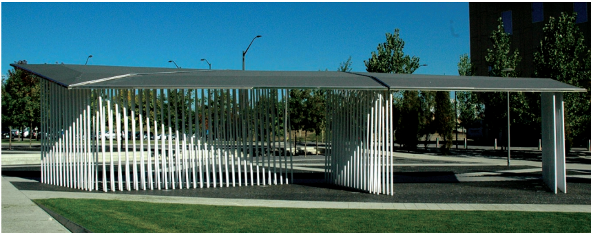
The pavilion as viewed from the rear, facing North