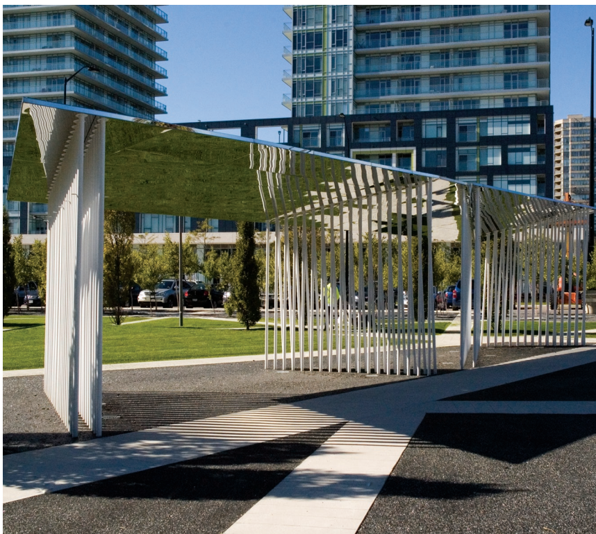
The Scholars Green Pavilion at Sheridan College Mississauga campus.