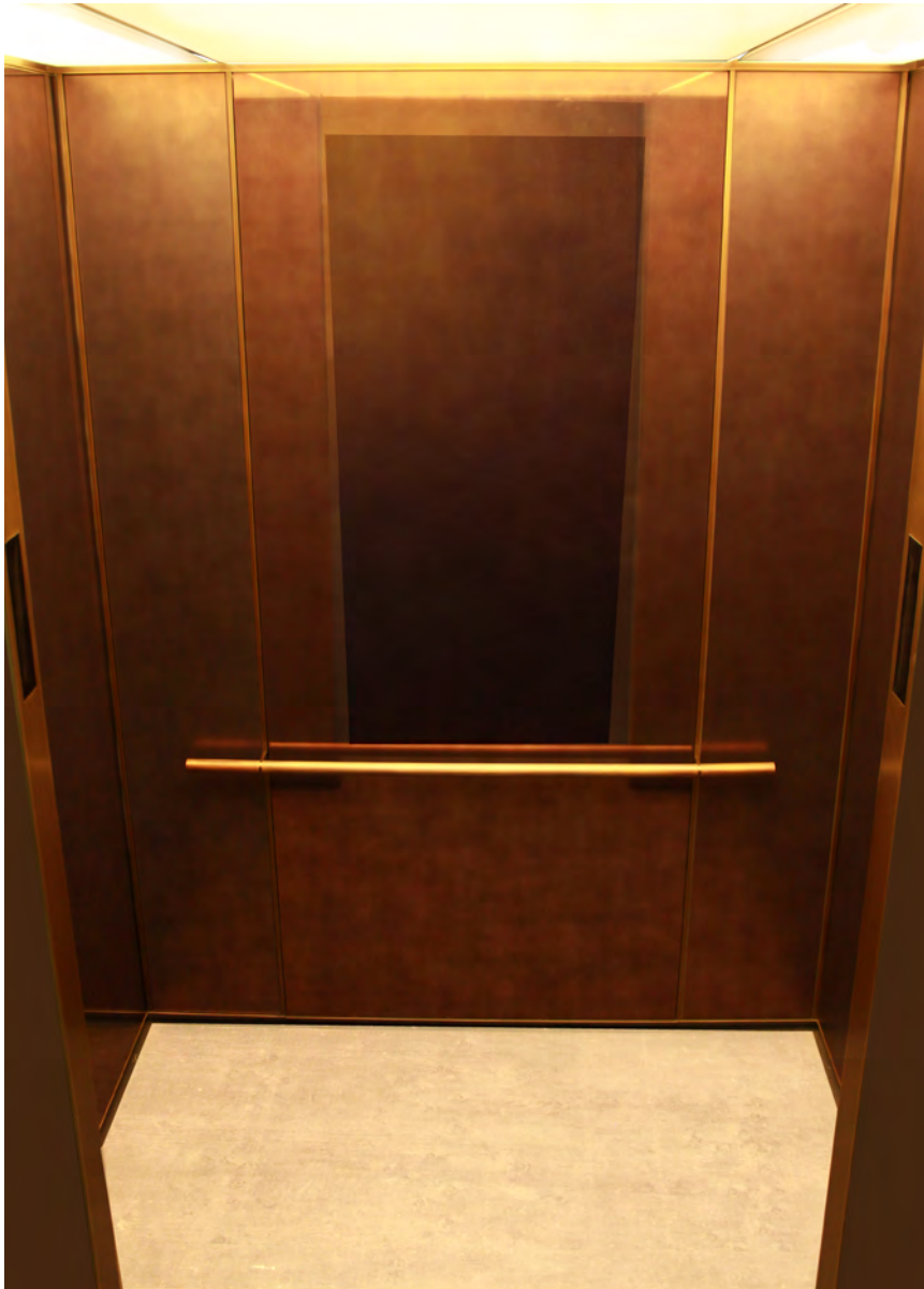
The back and side walls of glass and bronze with patinated bronze railing shown.