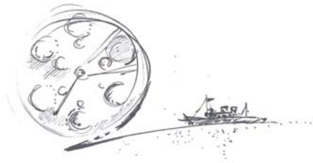
The original Libeskind concept sketch of the Wheel of Conscience monument