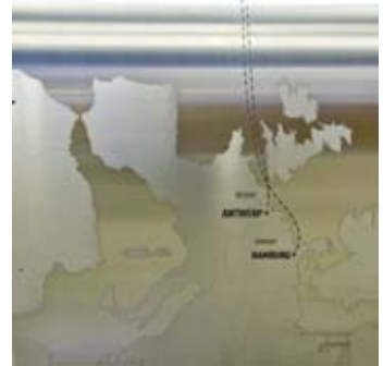
The cylinder side with etched route of the voyage

Highlights - The stainless steel clad, laser etched wheels on the face of the monument are turned by gears, which are symbolic of the ship's gears. On the rim of the large wheel is the description of the tragedy of the M.S. St. Louis. It is surrounded by an etched map of the world displaying the ship's route on the cylinder side of the monument. On the reverse side of the memorial are etched the names of all the passengers. The monument is built up from a 1/2" x 1/2" steel tube frame with heavy duty electric motors mounted and shaft connected to the internal 3" thick anodized aluminum gears. The exterior shell is 1/16" thick stainless steel that has the Soheil Mosun Limited specialty combo finish and is acid etched. The front artwork is a laser etched reproduction of an original photograph of the M.S. St.Louis. The entire front piece is glazed with 3/8" thick glass as protection from the gears.