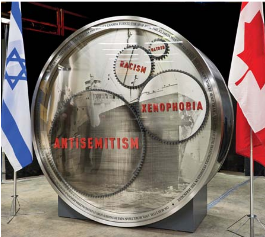
The Wheel of Conscience monument which memorializes the voyage of the M.S. St.Louis