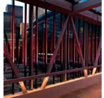
An interior view of the bridge

Highlights - This lighting system is a computer controlled multi-coloured, motion sensitive LED lighting system that has programmed artistic lighting patterns that respond to pedestrians walking through the bridge, creating an interactive experience. Clear tubes run from ceiling to floor holding the LED lights, while the wiring for same is completely hidden. Lighting is also installed beneath the handrails to provide a down-lighting effect.