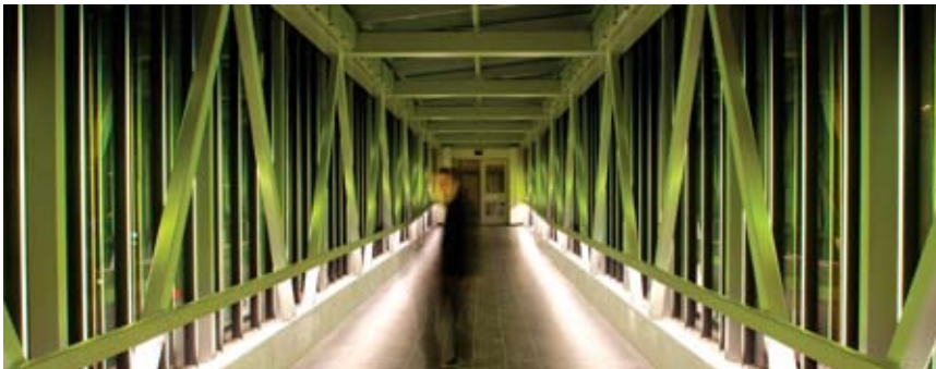
Viewing the bridge interior as lit in the evening