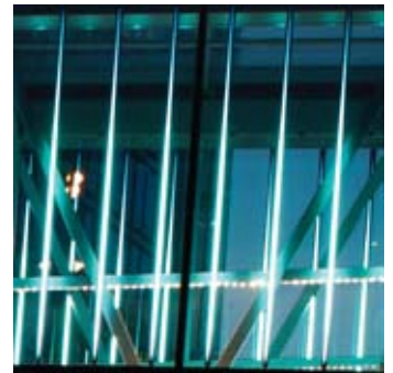
An exterior view of the bridge