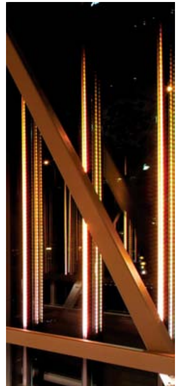
Detail of the LED lights in their plexi-tube casing