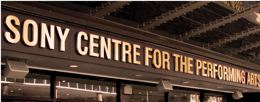
Solid bronze waterjet cut letters above the main theatre entrance