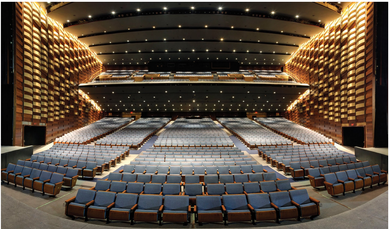
The main theatre of the Sony Centre for the Performing Arts fully restored