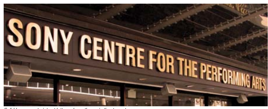
Solid bronze waterjet cut letters above the main theatre entrance