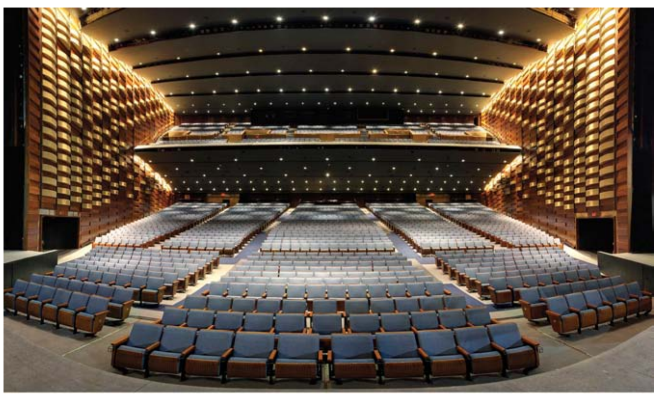
The main theatre of the Sony Centre for the Performing Arts fully restored