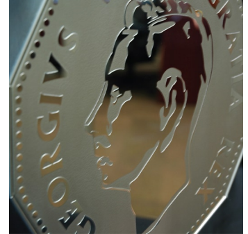
Ultra fine quality etching

Highlights - This Nickel Award features an oversize reproduction of a Canadian five cent piece. The material used is Supreme No.8 mirror finished stainless steel grade T304 of a 22 gauge thickness. The image from the coin was scaled up and etched onto the sheet metal then cut and sent to the Ontario Sheet Metal Workers Training Centre where it then was sent to Sudbury Ontario to be used in a training process whereby the full award was fabricated by trainees as part of the larger project initiative.