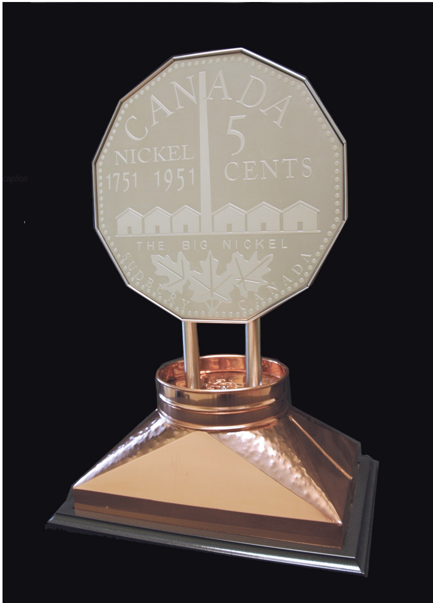
The Ontario Sheet Metal Workers Training Centre - Nickel Award