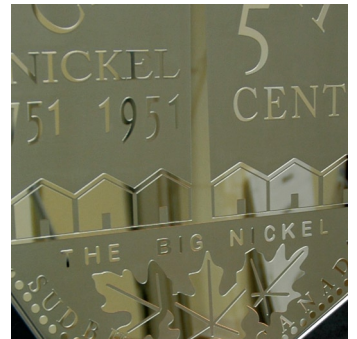
Detail view of high quality etching