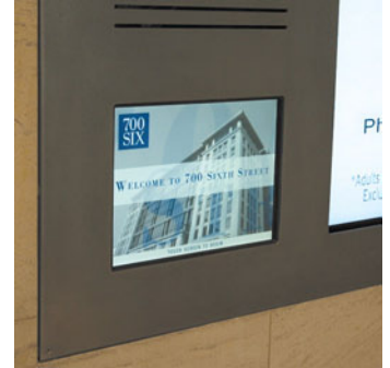
Detail of the lobby directory

Highlights - The custom air intake louvers are fabricated from painted aluminum extrusions which frame stainless steel architectural mesh panels. The lobby directory face panel was fabricated from stainless steel with water jet cut out openings for screen and speakers. Custom concealed hinging keeps panel flush with stone wall. In January 2010, SML was selected the winner of the Washington Building Congress Craftsmanship Award® which recognizes SML's outstanding skill and achievement on its scope of work for the 700 Sixth Street NW project.