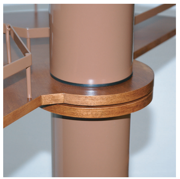
Adjustable node allows for up to (5) shelves