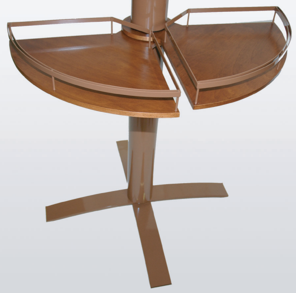
(2) stained and lacquered wood veneer shelves