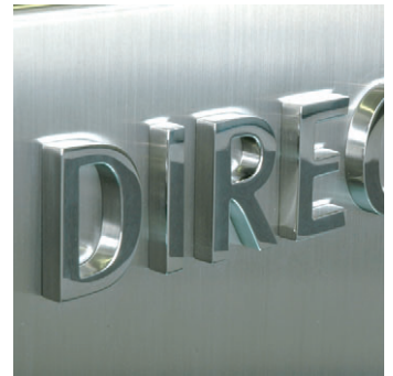
Polished st. stl. lettering on brushed st. stl. cladding