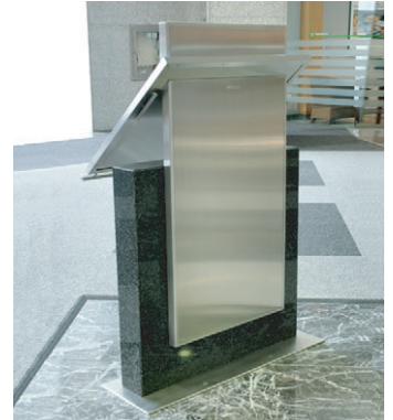
Back of directory featuring brushed st. stl. cladding

Highlights - Directories utilize a welded steel sub-frames, with Nero Impala black granite cladding at the bottoms, stainless steel cladding at the tops, and cantilevered clear glass faces protecting full-color printed maps and tenant information.