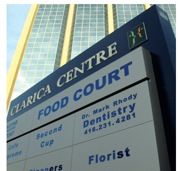
Welded aluminum over steel frame