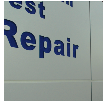
Detail of the incised and infilled acrylic lettering