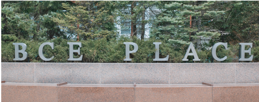
Garden court precision welded st. stl. channel letters

Highlights - Each character of the TD Canada Trust Tower main identification is made up of (2) individual channel letters. Each top letter is mirror polished stainless steel with sandblasted st. stl. returns - which are pinned away from the second, black painted channel letters. Eye-level column letters are made of waterjet cut, black anodized aluminum mounted onto mirror polish st. stl. letters and pinned mounted on granite face. The Bay Street Obelisk letters are also waterjet cut, mirror polish pinned mounted. The Garden Court channel letter signage is made of precision welded, brushed st. stl. and rear mounted to give a floating illusion.