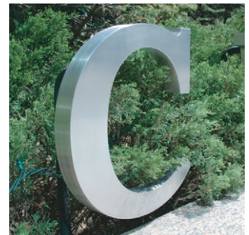
Close-up of precision welded st. stl. channel letter