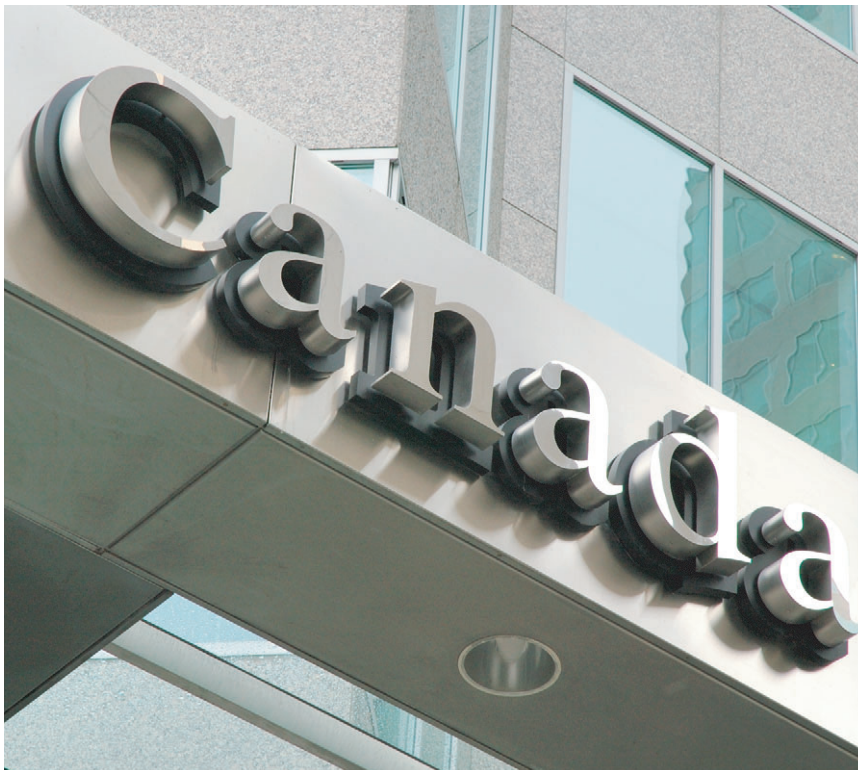
TD Canada Trust Tower main identification