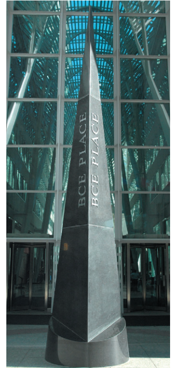
St. stl. letters pinned mounted on granite obelisk