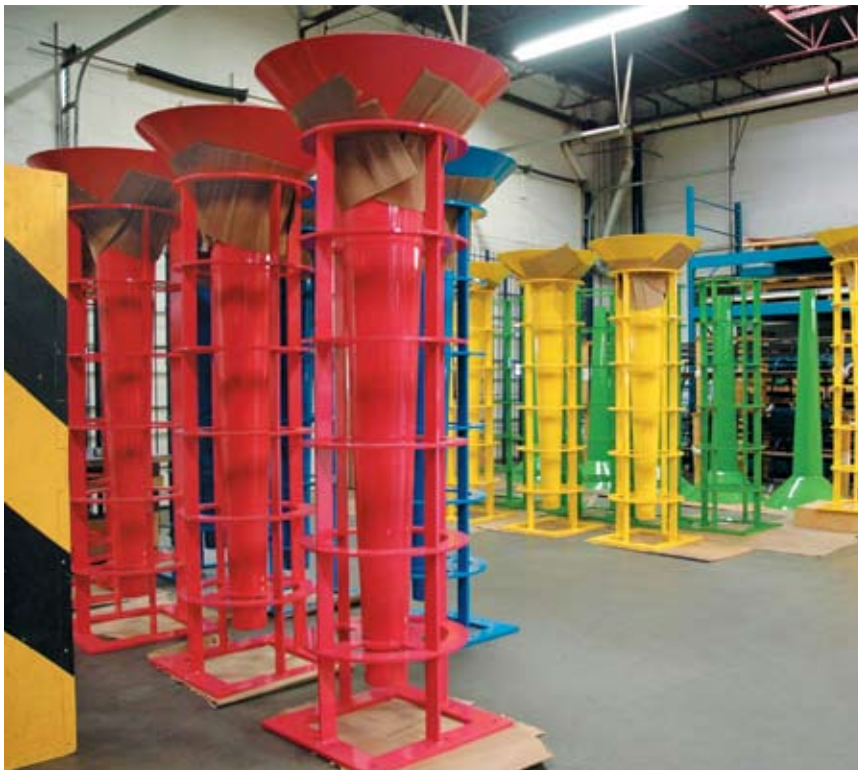
Colourful water downspouts to match the theme of Barbados