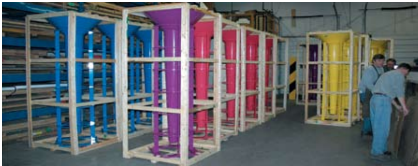
Downspouts are ready for shipping with custom crating