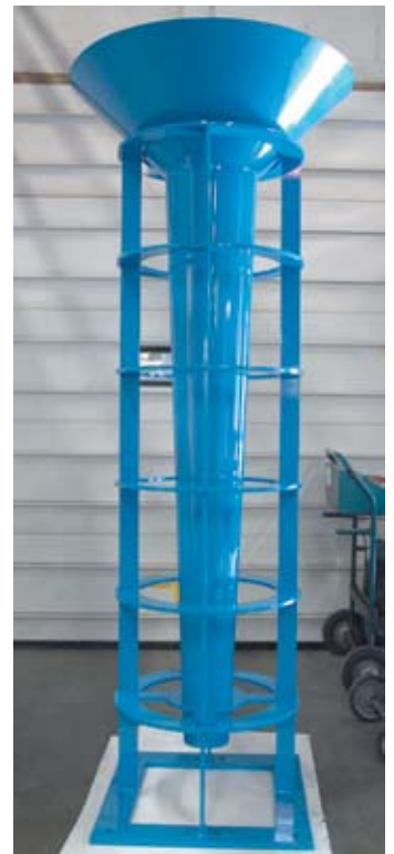
Individual water downspout