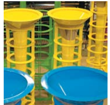
Powder coating inside cone