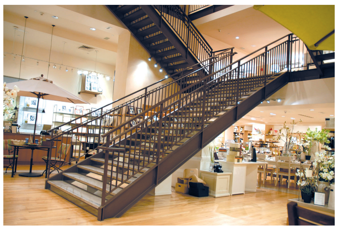
Painted steel staircases with concrete filled pan type treads and glass risers