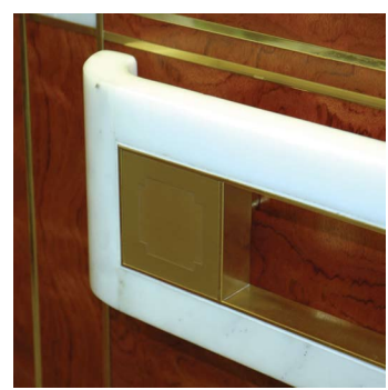
Detail of the White Marble Hand Rails