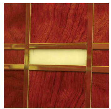
Detail of the Marble and Brass Inlays

Highlights - Drop ceiling fabricated in two types of marble completed with polished brass inlays, back-lit with compact fluorescent lighting as well as recessed down lighting. Rear and side walls fabricated with "Bubinga" veneered wood paneling with polished brass inlays. Flooring made from custom water-jet cut shaped marble tiles completed with polished brass inlays. Doors clad in polished brass metal.