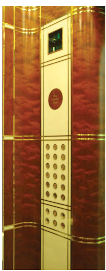
Marble Operating Panel with Brass Inlays